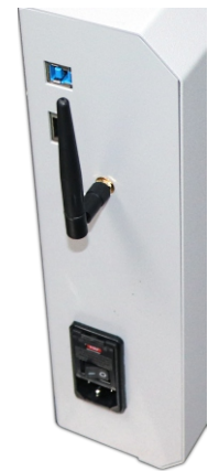
Three PC interface ports: USB 3.1, Ethernet, WiFi

Specifications are subject to change without notice.