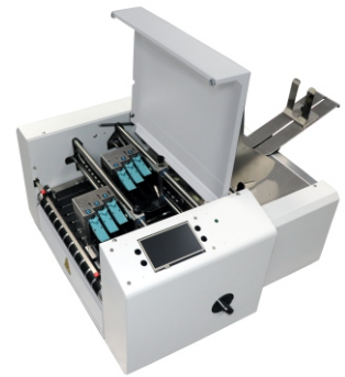
Six proprietary Inkjet cartridges deliver 3" print area for quality addressing.