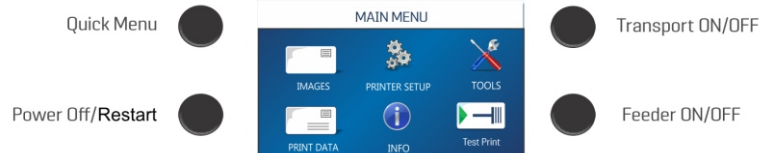
Easy to use: Large touchscreen provides full printer control and system status!