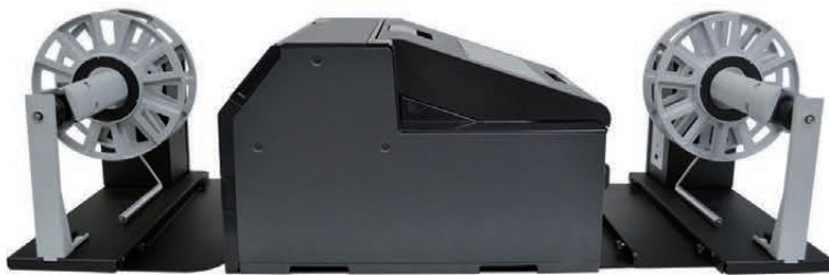
LABEL REWINDER - Epson C6500A Printer - LABEL UNWINDER (Not included)

The Roll to Roll system specifically designed for Epson C6500A color label printer can handle rolls up to 220mm (8.66") media wide and having an outside diameter up to 250mm (10"). Both Unwinder and Rewinder are equipped with a fixed 3" core holder.